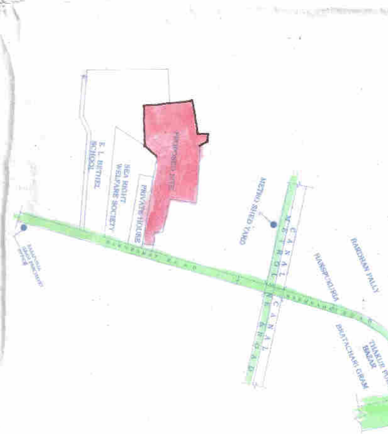
LOCATION PLAN SCALE: 1 : 3000