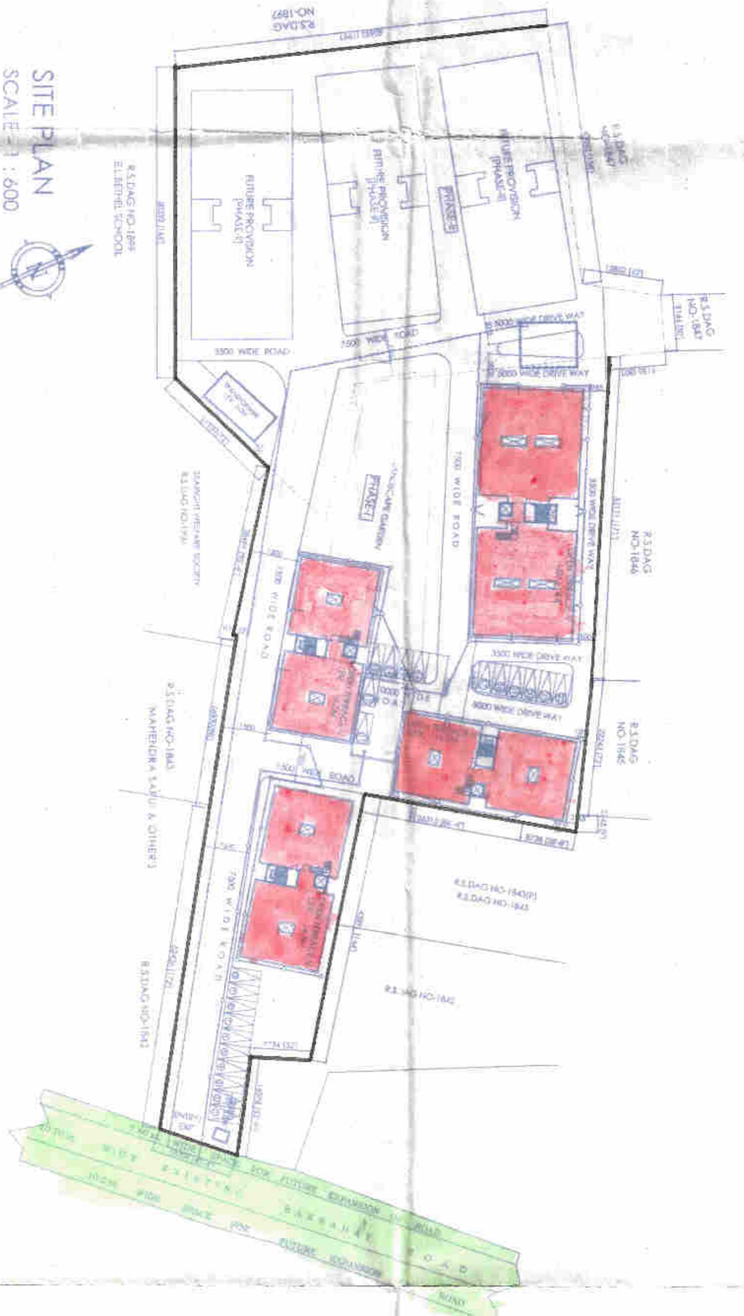
SITE PLAN SCALE: 1:400