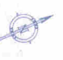
LOCATION PLAN SCALE: 1:3000