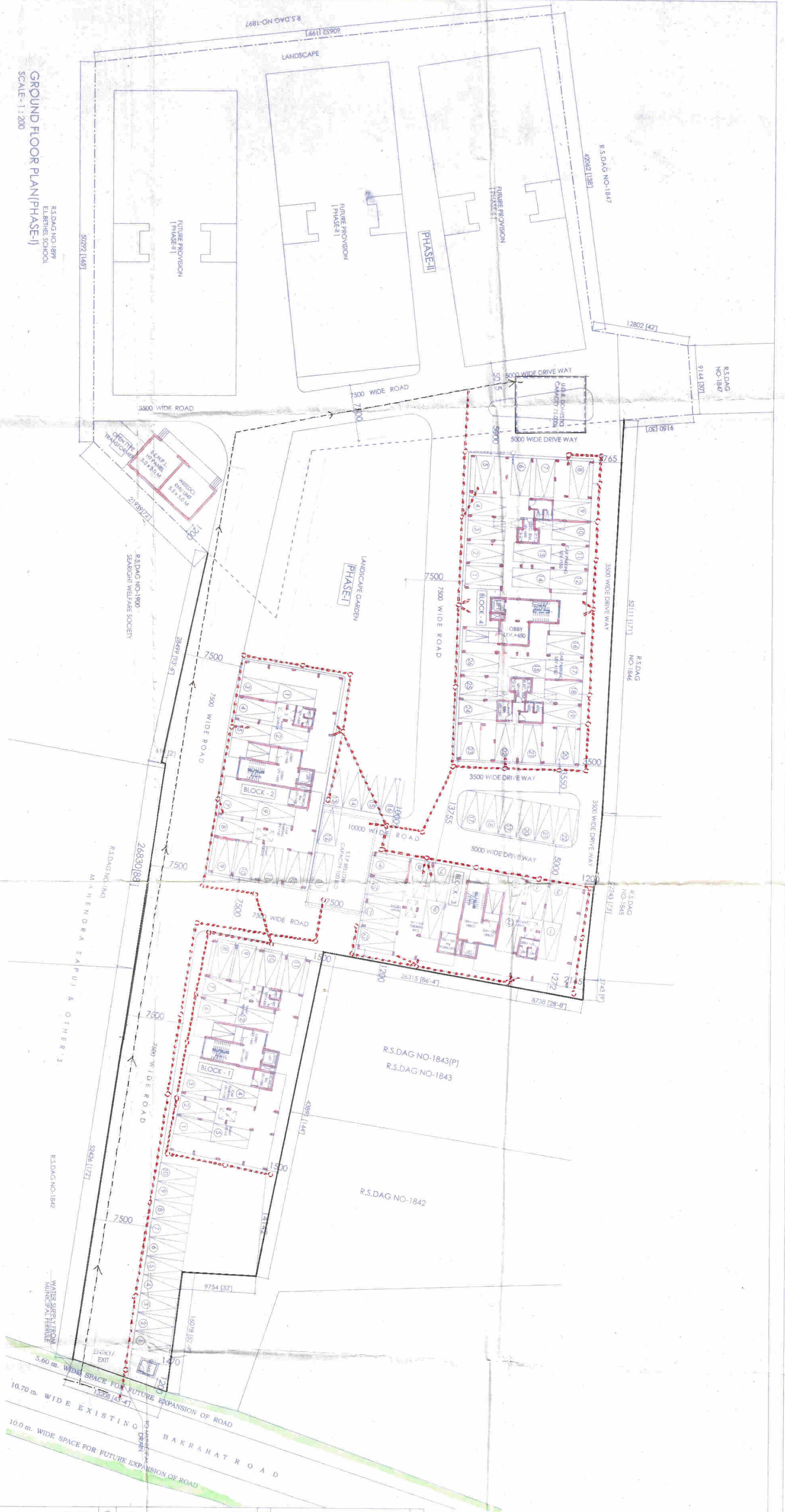
GROUND FLOOR PLAN(PHASE-I) SCALE: 1:200