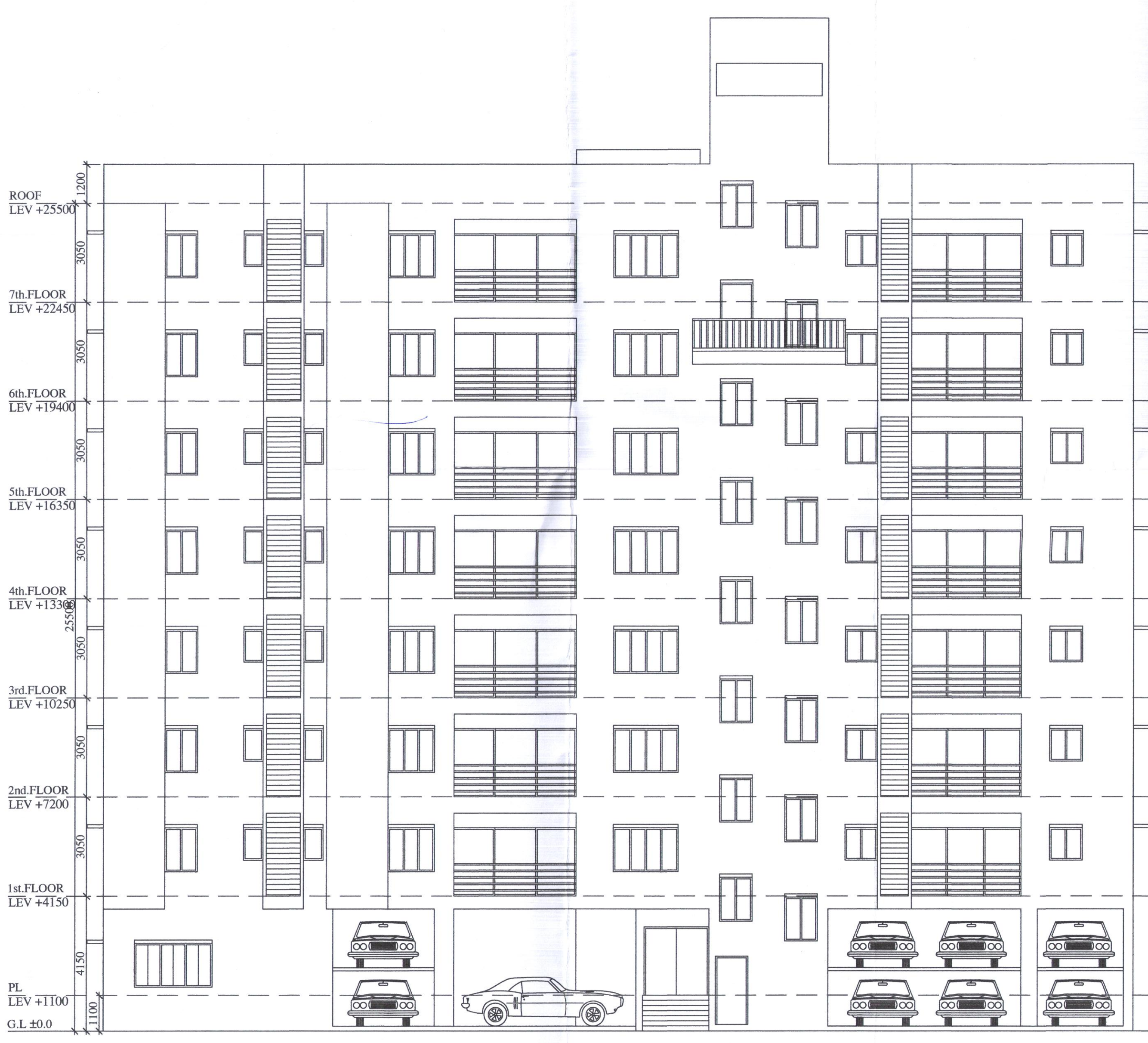
EAST (RIGHT) SIDE ELEVATION