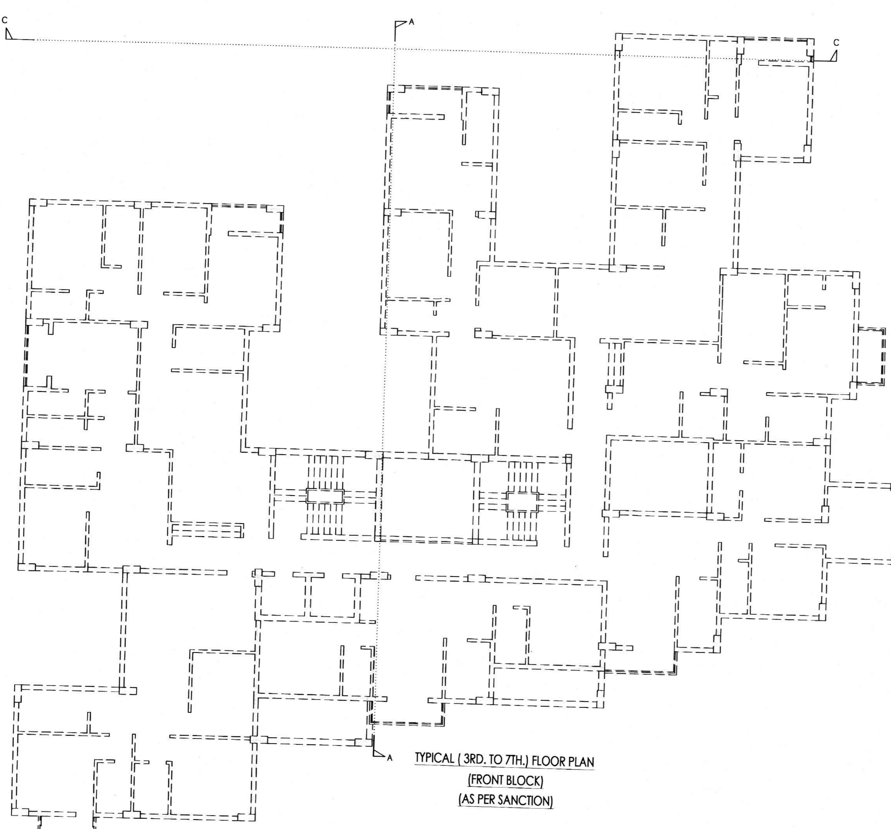
TYPICAL (3RD. TO 7TH.) FLOOR PLAN (FRONT BLOCK) (AS PER SANCTION)