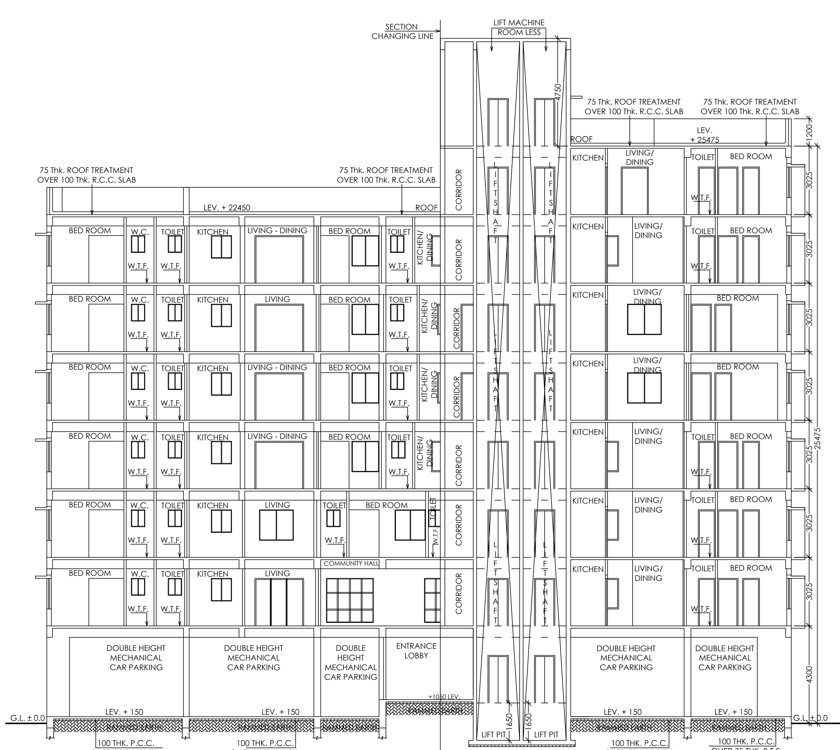
SECTION THROUGH Y - Y' SCALE : 1 : 100

COMPLIANCE OF MUNICIPAL COMMISSIONER'S CIRCULAR NO. 57 OF 2024 - 25, DATED : 26 / 11 / 2024. WATER SUPPLY DEPARTMENT APPROVED THE INSTANT CASE. THE APPLICANT IS TO ARRANGE WATER SUPPLY THROUGH LICENSED PLUMBER FOR BUILDING CONSTRUCTION PURPOSE.AS PER APPROVAL OF DY.CE(C) WS(S) DT 20 / 06 / 2024. Civil Comment : EXISTING KMC SEWER INFRONT OF THE PREMISES DOI-1.375 M DIA 450 MM . POSITION OF SEPTIC TANK TO BE MADE AS PER PROVISION RELATED TO STANDARD CODE OF PRACTICE. SEWERAGE LINE DATE OF APPROVAL OF DRAINAGE DEPARTMENT (K.M.C.), DATED : 29 / 06 / 2024.