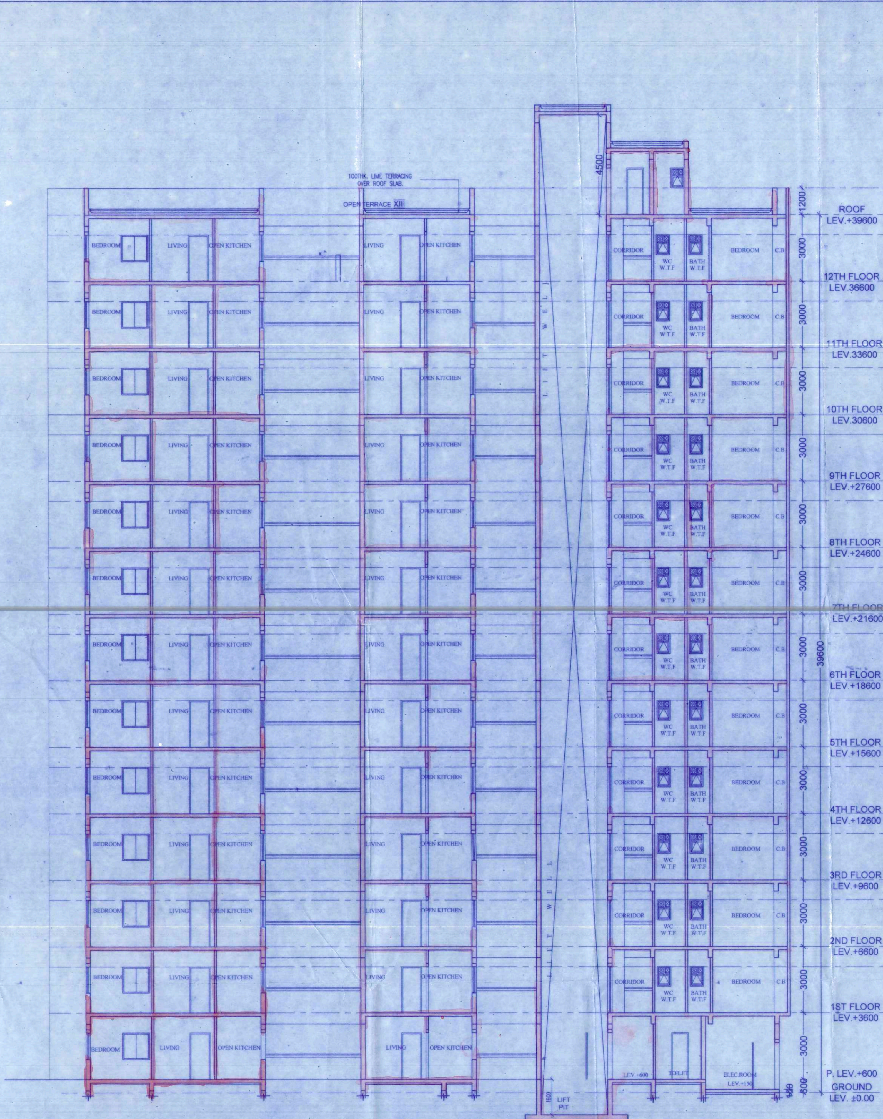
SECTION BB TOWER-5

PROJECT (PHASE-I) PROPOSED AFFORDABLE HOUSING UNDER PRADHAN MANTRI AWAS YOJANA AT PRE. NO.39/1 SHALIMAR ROAD, MOUZA SHIBPUR SHEET NO.169,170,179,180, J.L. NO. 1, L.R. KHATIAN NO. 170,9,15,17, L.R. DAG NO. 12,13,39,40,41,42,44,45,60,61,62,63,6,7,8,9,10,11,12,13, 14,15,16,17,21,22,24,1,2,11 P.S-SHIBPUR, WARD NO-39, BOROUGH -V,DIST HOWRAH-711103, UNDER HOWRAH MUNICIPAL CORPORATION.WEST BENGAL.