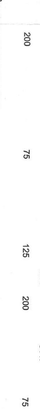
PLAN OF UNDER GROUND RESERVOIR SCALE: N.T.S