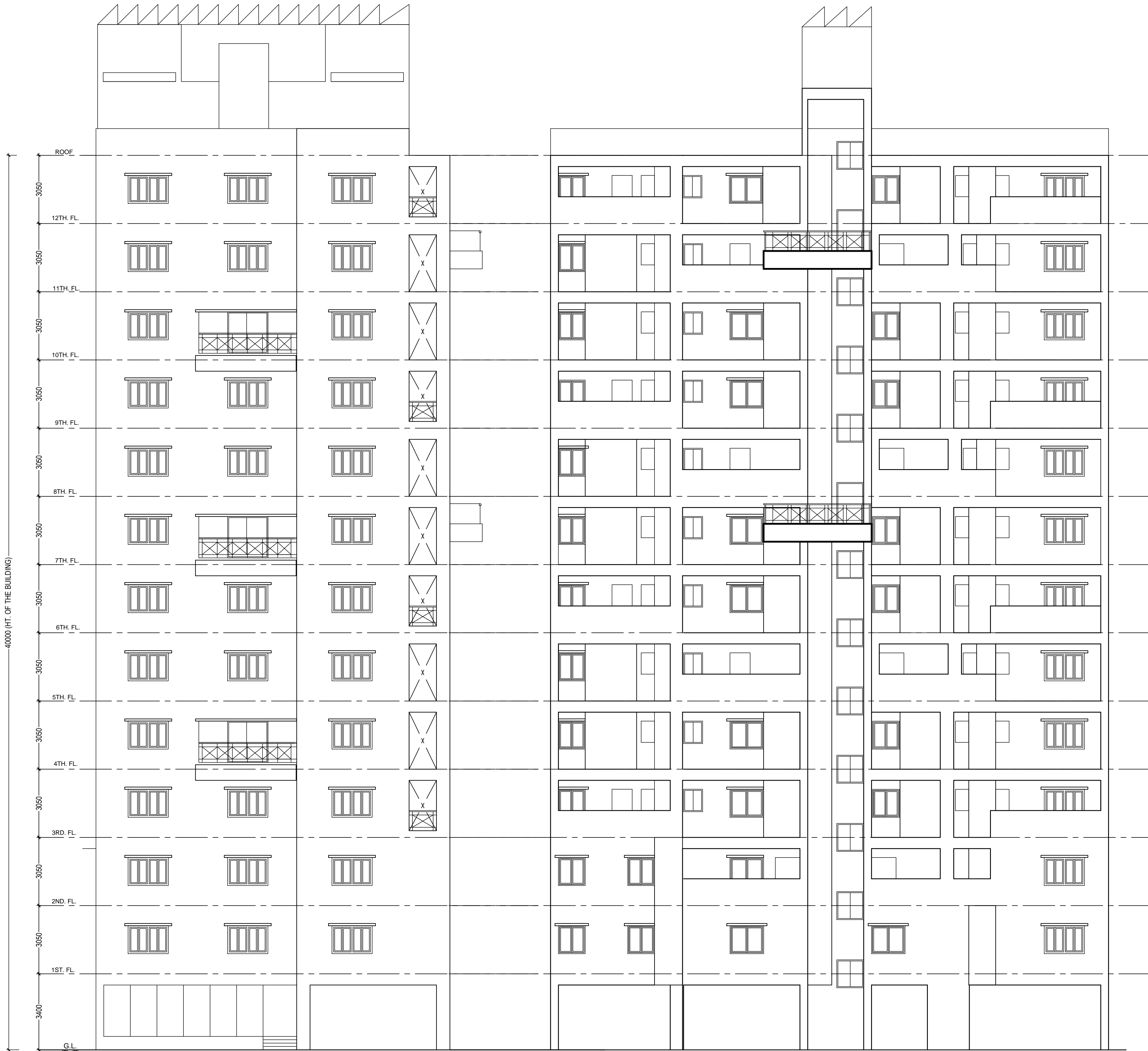
FRONT (WEST) SIDE ELEVATION. (SCALE= 1:100)